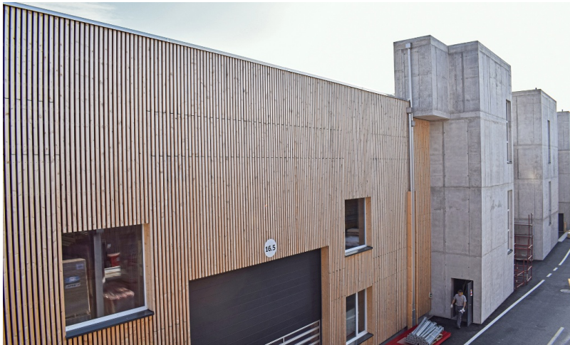
Hall construction in impressive dimensions