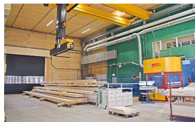
The large floor area inside factory assembly hall 16 allows even larger volumes of wood to be processed and the work processes to be optimised.